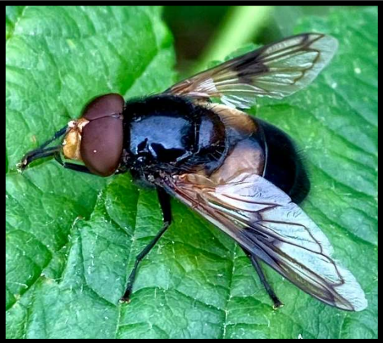
Volucella pellucens