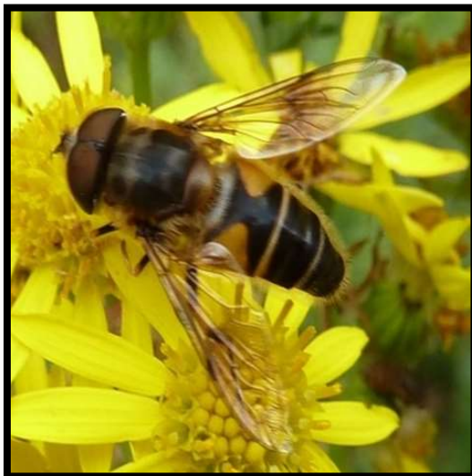
Eristalis pertinax