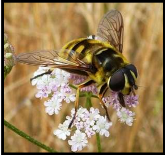
Myathropa florea