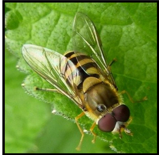
Syrphus ribesii