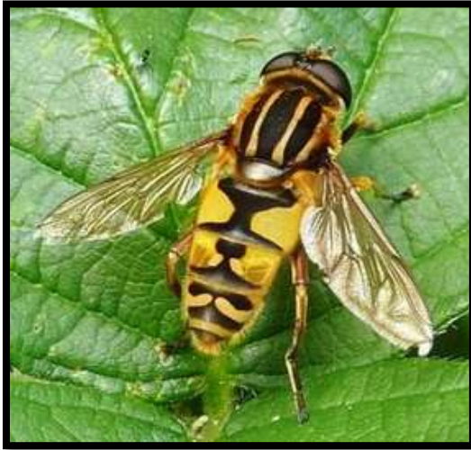
Helophilus pendulus