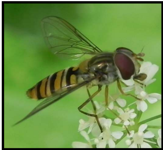
Episyrphus balteatus