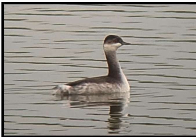
(Above left to right) Black-necked Grebe , Neatholme Pit, 28 th August and possibly the same the bird? on Neatholme Scrape, 29 th August

Waders until this month have been scarce to non-existent this year so the dropping of water levels on Neatholme Fen and the almost perfect wader habitat at Cross Lane Fishery will reap benefits going forward. Greenshank were much in evidence with singles at Cross LF on the 7 th , 8 th and 9 th , a single over Neatholme Scrape on the 11 th , 3 at Neatholme Fen on the 16 th and finally 4 birds again at Neatholme Fen then flew towards Lingham Pool on the 30 th . Green