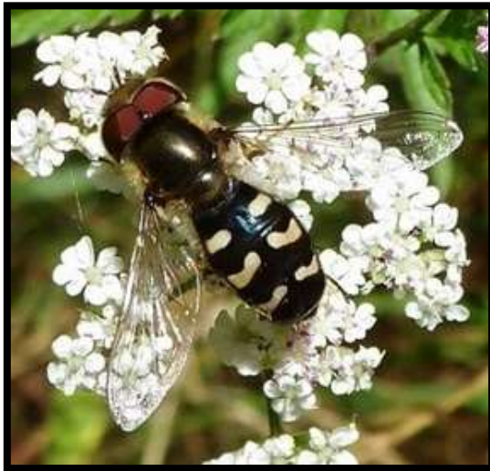
Scaeva pyrastris