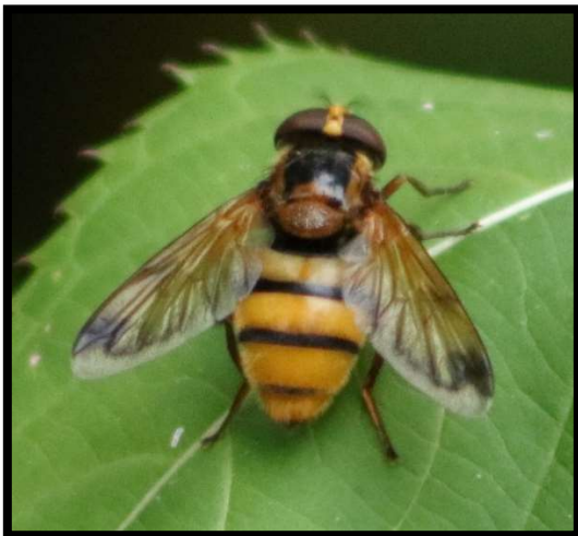
Volucella inanis