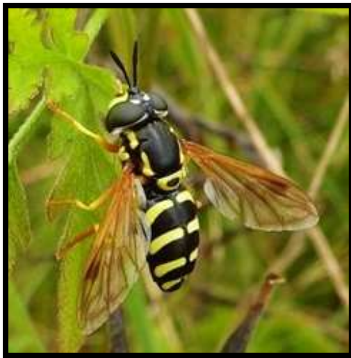
Chrysotoxum festivum