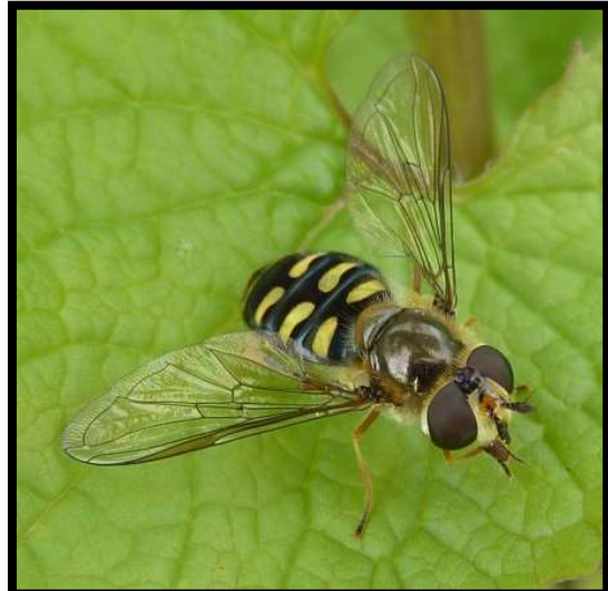
Eupeodes luniger