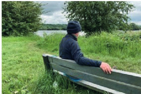
▲ Reviewing the accessibility of benches