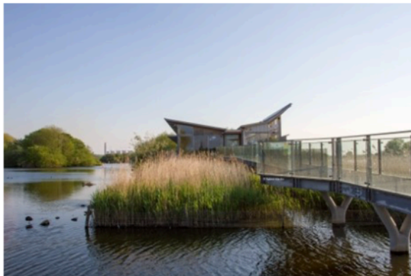
▲ Attenborough Nature Centre and Reserve

Nottinghamshire Wildlife Trust engaged Leonard Cheshire to conduct an access audit of Attenborough Nature Reserve and Centre as part of their "Attenborough for All" project. This initiative aims to enhance the accessibility of the site for all visitors, particularly disabled individuals. Recognising the importance of inclusivity, Nottinghamshire Wildlife Trust sought to identify barriers that may impact the visitor experience, focusing on areas such as uneven pathways, signage, and sensory-friendly resources. The comprehensive assessment was undertaken to propose effective solutions that would promote accessibility and inclusivity at the Centre.